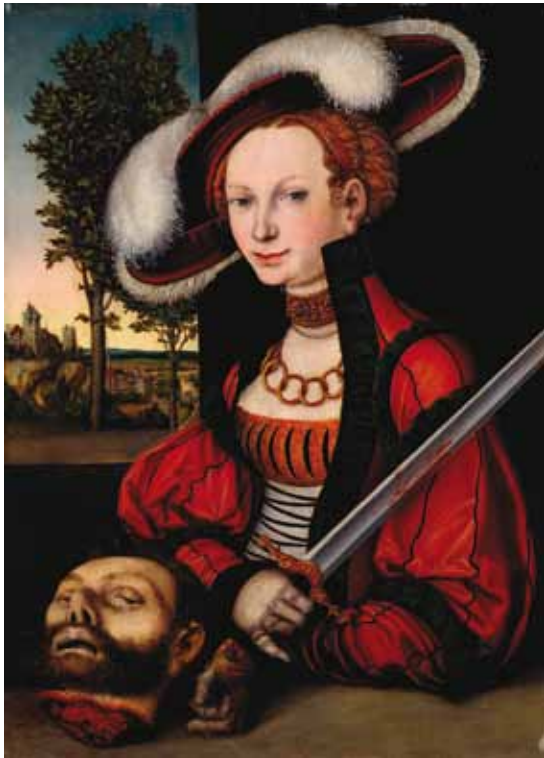
Lucas CRANACH THE ELDER, Judith with the Head of Holofernes.

Judith with the Head of Holofernes Lucas CRANACH THE ELDER, 1472 - 1553 German