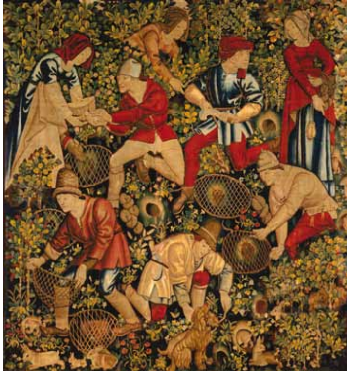
Peasants hunting Rabbits with Ferrets Tapestry.