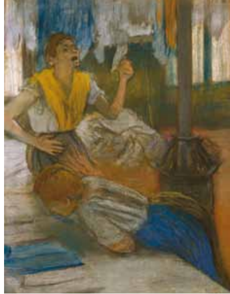
Edgar DEGAS, Reading the Letter.

Reading the Letter Edgar DEGAS, about 1882 - 1884 French